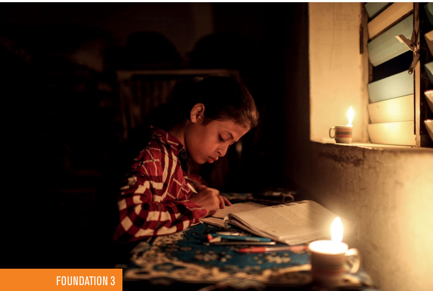
© NRC / Wissam Nassar, Palestine