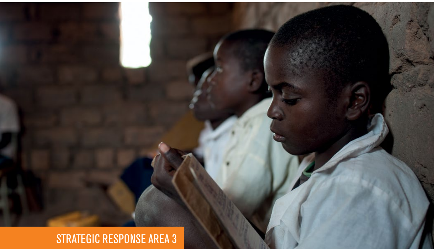
DR Congo