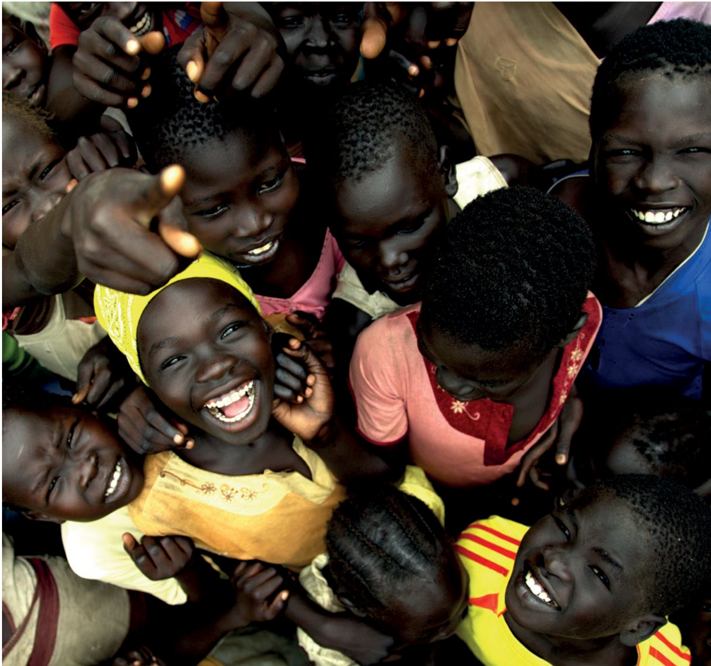
South Sudan