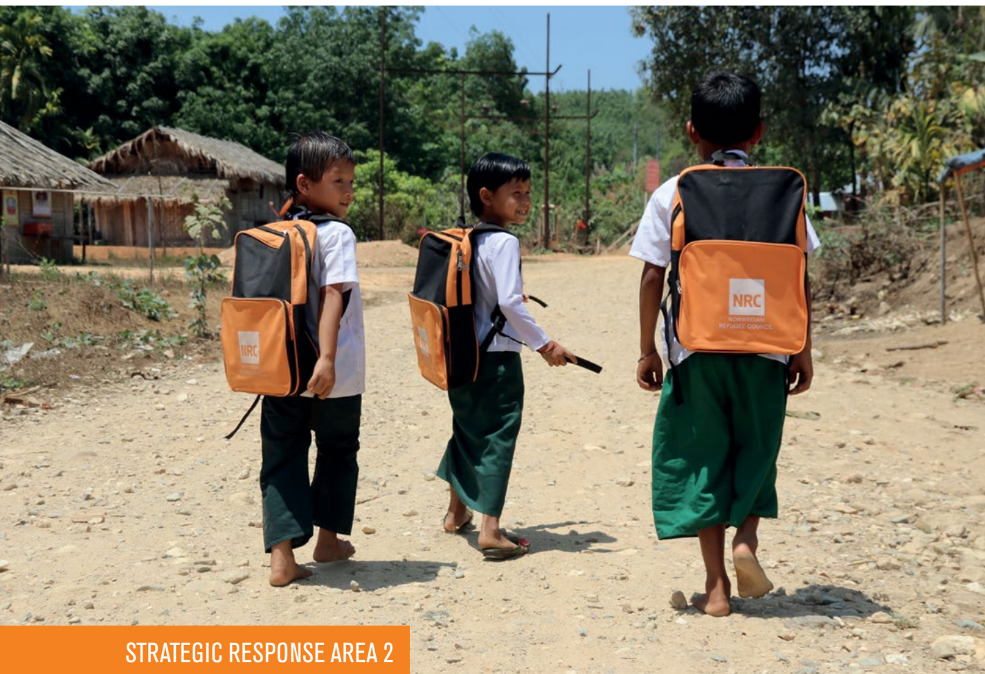
© NRC / Ingrid Prestetun, Myanmar