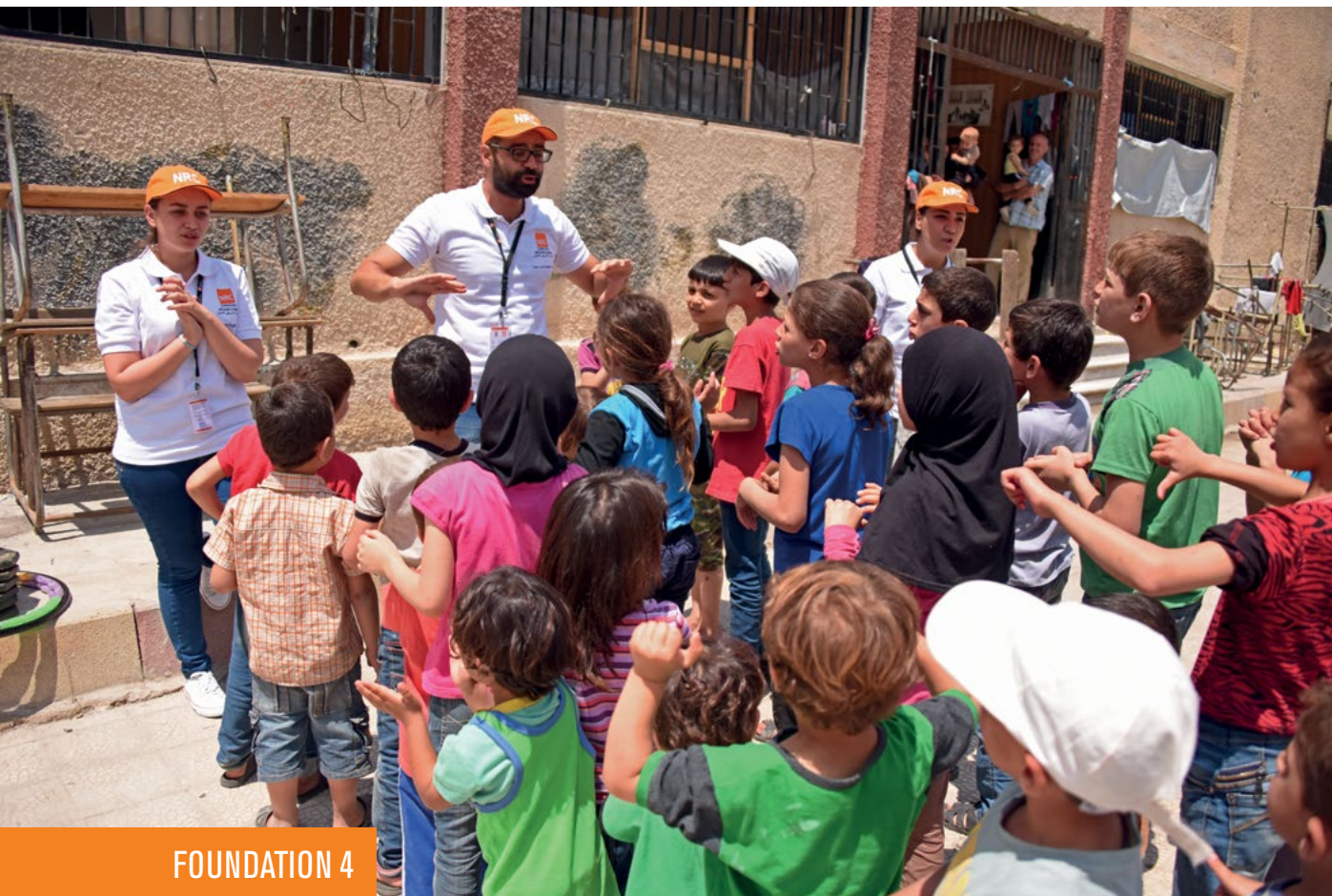
© NRC / Karl Schembri, Syria