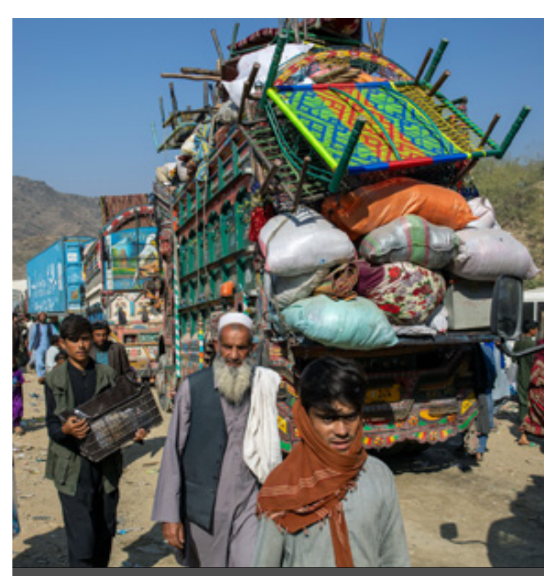
• Loaded trucks carrying house materials and Afghan returnees in Torkham as they make their way back to Afghanistan from Pakistan.

Donors suspended all budget support and any development project that would require engagement with the DfAs immediately after the UCG. Many traditional development donors also froze their wider engagements. Some modified development activities from bilateral budget support to short-term community-level projects with financing mainly channelled through UN agencies. The EU announced a €143 million development aid package in 2023, in support of 'basic needs' in Afghanistan, including support for interventions in the areas of health, nutrition, education and livelihoods (European Commission, 2023).