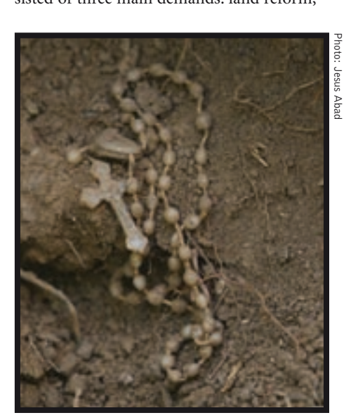
The victims' graves bear witness to the grotesque attacks to which many civilians have been exposed.

The conflict in Colombia has its roots far back in the country's history. The government can only negotiate on the basis of the established order, even though it is precisely this order that the guerrillas have been fighting against for over 40 years. The guerrillas' original point of departure in the 1960s consisted of three main demands; land reform.