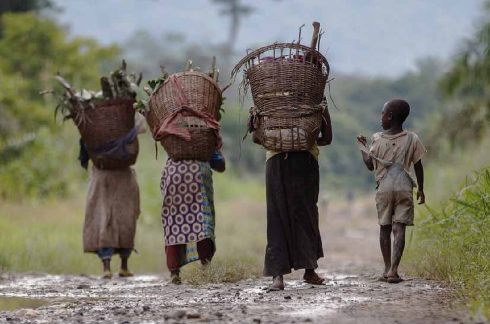
Caption: Pinga, DRC. NRC/Vincent Tremeau, 2015.

the risk. Likewise, while the wording may seem to be a minor issue, overstating the situation means that there may be less attention paid if there is eventually deterioration into a context of true ethnic (or religious, racial or other) cleansing or forcible transfer.