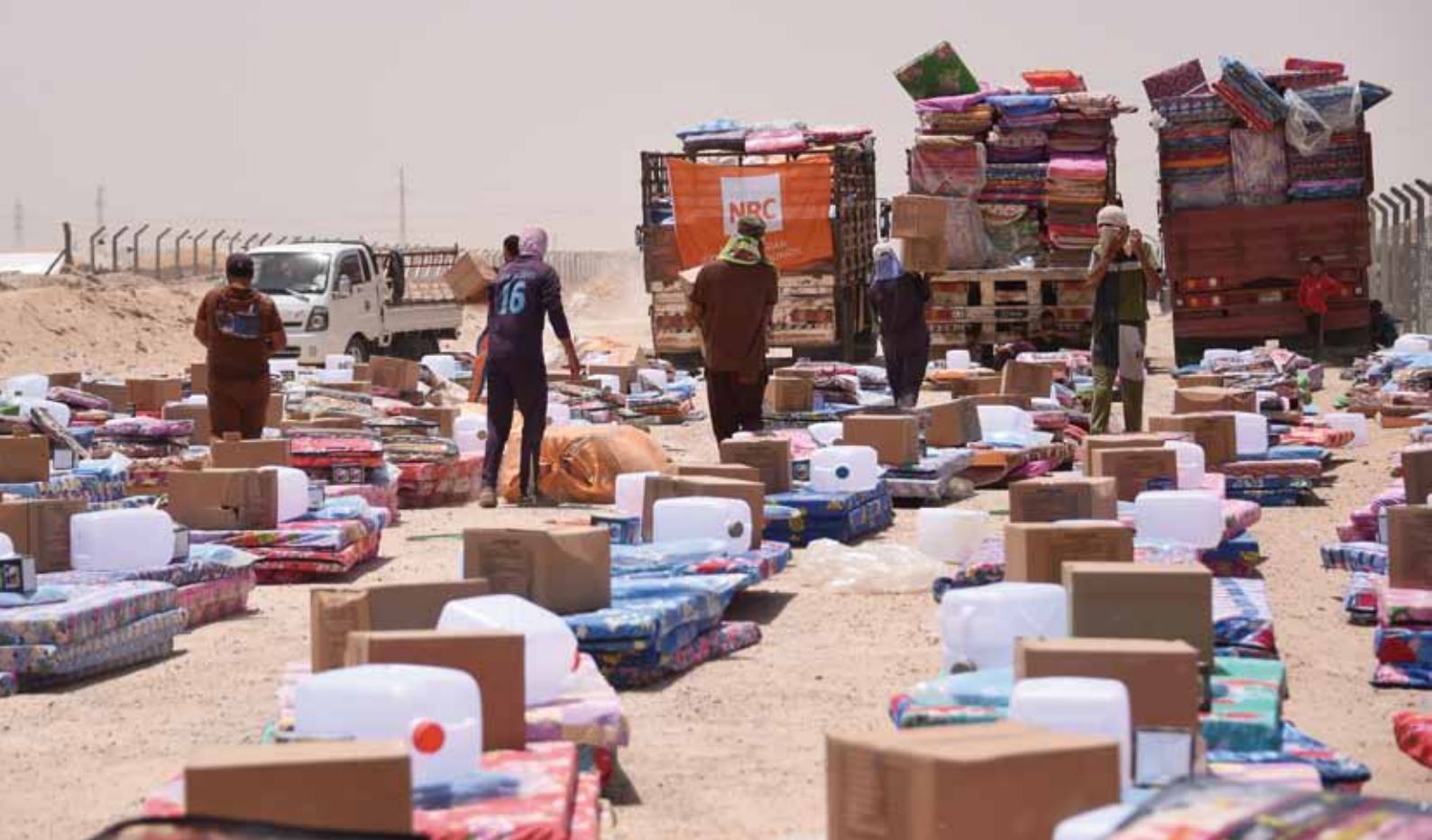
Fallujah camp preparation for distribution to new arrivals.

offer assistance, particularly in regards to advocacy with UN organisations. Other organisations should similarly be encouraged to contact their head offices. 8