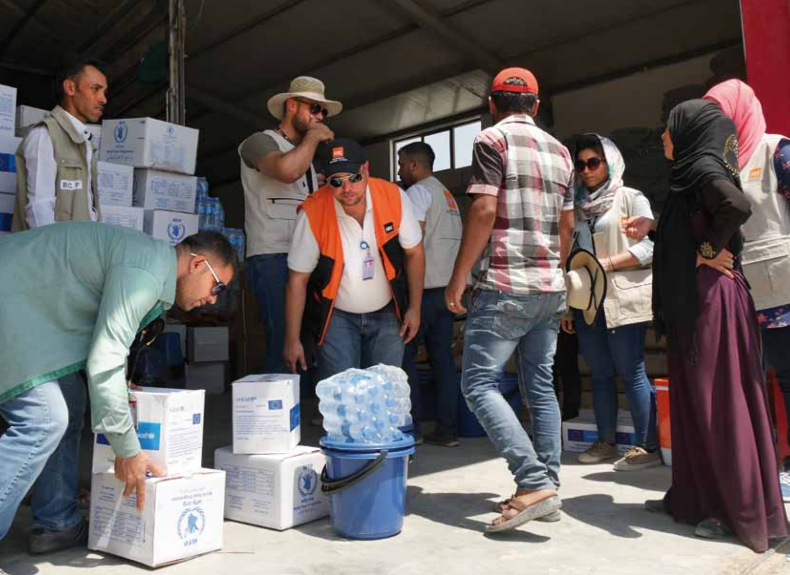
Displacement camps in Debaga hosting families displaced from Makhmour in Iraq.