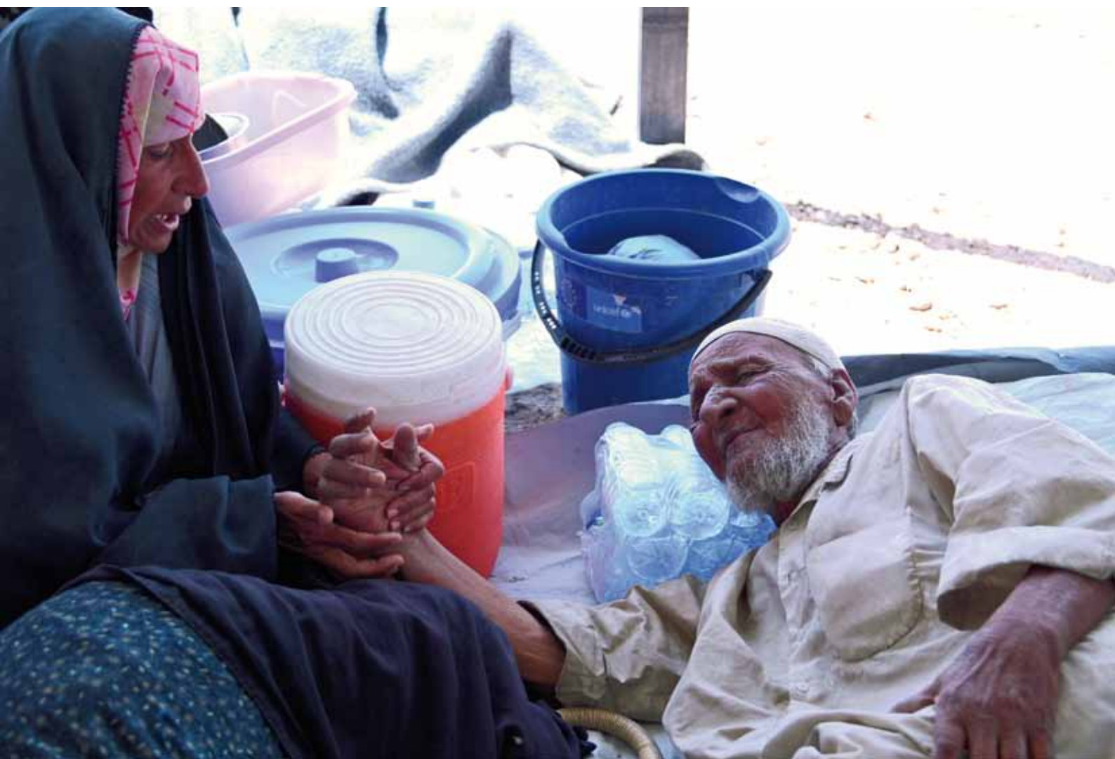
Dozens of families were displaced from Fallujah in 2016 and hosted inside a mosque. NRC/Karl Schembri, 2016.

In assessing the risk, it is also important to consider the alignment of the party opposing the evacuation. If the party is aligned with the civilians in the area, it is less likely that they will use force on their own people to prevent the evacuation from proceeding (although humanitarians should still assume that this is not entirely out of the question). If the controlling party is in opposition