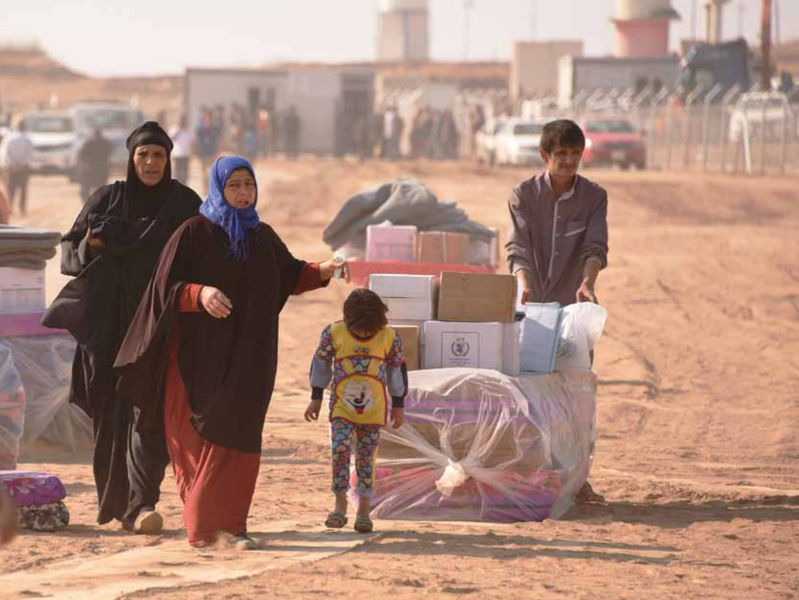
Captions: Khazar Camp, Iraq. NRC, 2016.

discussions are rarely simple. Humanitarians should avoid a situation in which they are forced to adhere to terms set by a party to the conflict, but where there is an opening, humanitarians may need to make use of a rare window to evacuate a besieged population.