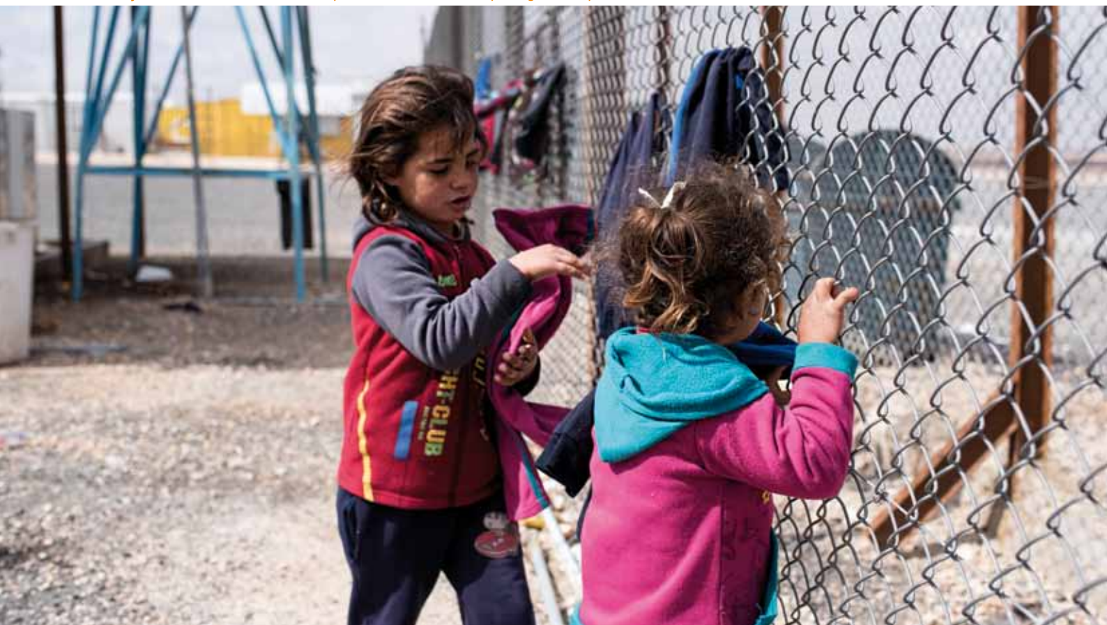
Syrian children at NRC's reception area in the Azraq refugee camp in Jordan.

Human rights monitors should ideally be present in all evacuations, but this is particularly true if humanitarians feel that there is a risk of part of the convoy being stopped, diverted or having individuals detained. As a first step, where consent has been obtained from the state or party to a conflict, the Chief of Convoy should encourage the individual to call their commanders for