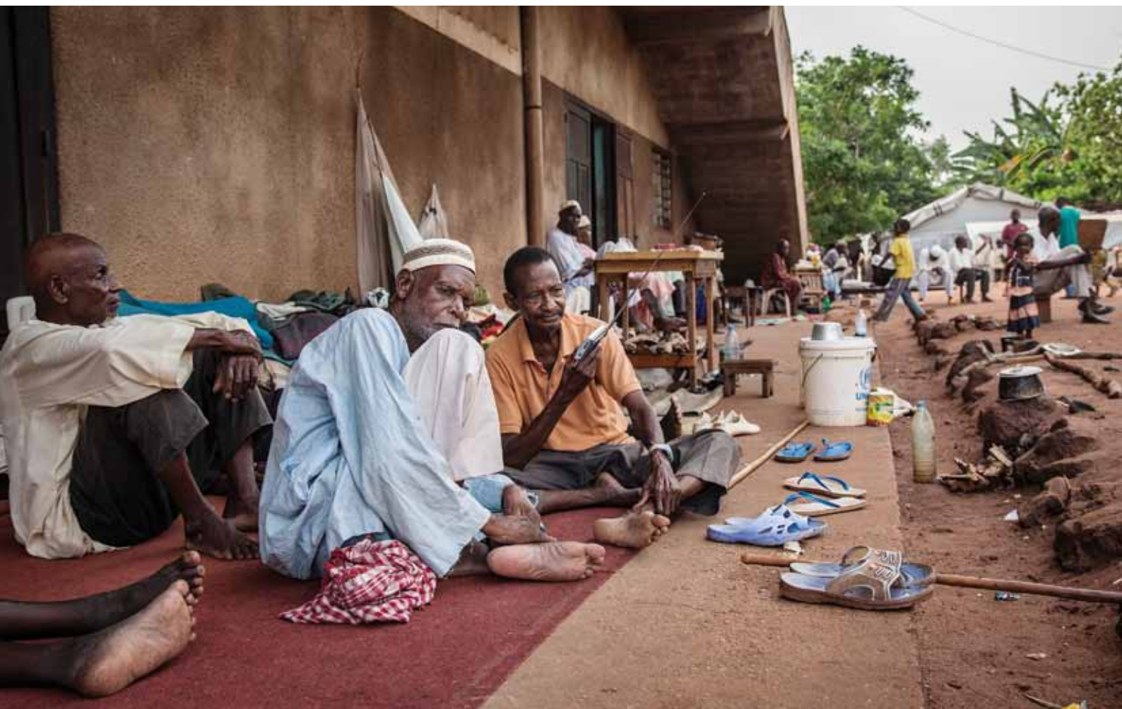
Muslim enclave in Carnot.

This dilemma is the more challenging relative of the issue listed immediately above. In this instance, humanitarians are concerned that the parties to the conflict are intentionally trying to force humanitarians to evacuate the civilian population. There are many ways the parties may do this, ranging from direct attacks on an