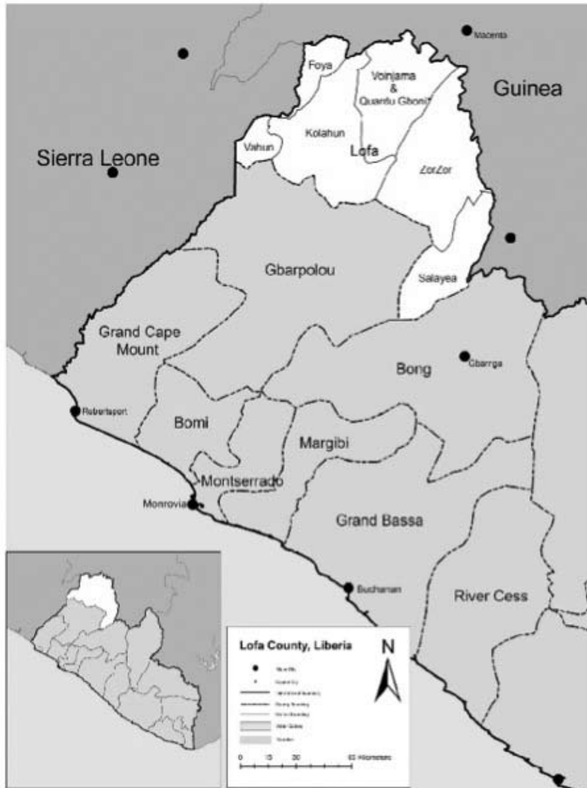
Source: A. Coriveau-Bourque Data: Global Administrative Areas (2010)