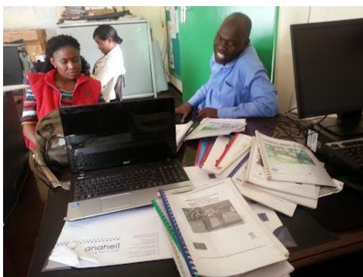
Figure 2: Copies of Ward Plans at the RDC in Chiredzi District