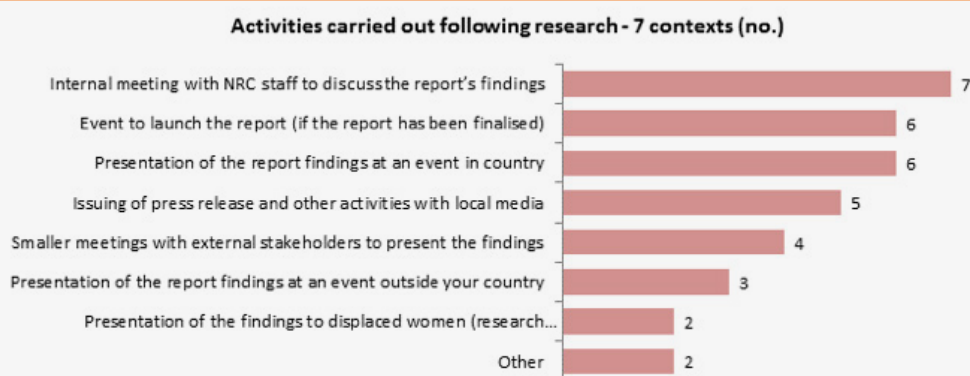
Figure 3: Activities carried out following research

The publication of the research at the country level was an opportunity for COs to promote the report's findings and all COs held internal discussions and an external launch, as seen in Figure 3 10 . CO staff commented that the launch and the associated meetings and discussions heightened awareness of the research findings, which contributed to changes both internally and externally (as detailed below), although not all opportunities could be followed up and fully capitalised on, as discussed below.