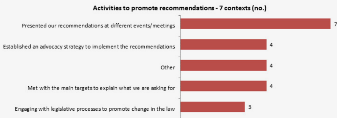
Figure 5: Activities to promote recommendations

The capacity of COs to follow-up and monitor the implementation of report recommendations was limited and varied from country to country. According to CO staff interviewed, beyond the research launch, the follow-up was not fully optimised in most contexts and activities to do so were limited, as seen in figure 5. All COs reported that they were monitoring implementation internally but only three reported monitoring recommendations externally (Afghanistan, Liberia and South Sudan). Examples provided of recommendations being monitored tended to be internally focused, such as: Increasing support for women groups and increase in legal education; acquiring a deeper understanding of the existing informal mechanisms; increasing number of cases for women; modifying the requirements for access to social programmes and credits for women refugee.