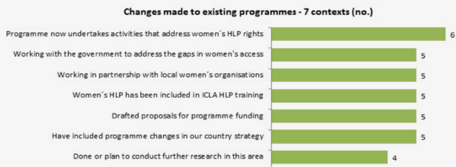
Figure 4: Changes made to existing programmes

A main result of the research with potentially a longer-term impact was the changes made to NRC programmes, as seen as the top scoring element in both figures 2 and 4. The ICLA programme was the main beneficiary of such changes, although Shelter programmes were mentioned, although this seemed more to be about the constructive working relationship between the relevant staff rather than the result of research (e.g. as reported in Jordan). Of note, the NRC programmes were not listed specifically as targets in the HLP advocacy strategy but considered in the broader “humanitarian practitioners”.