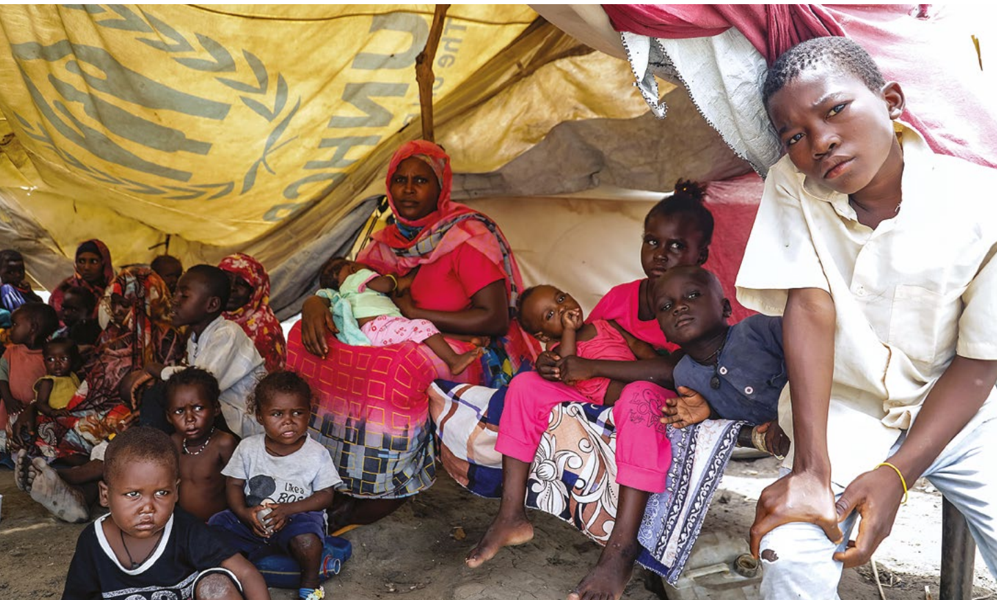
📷 Families fleeing Khartoum found refuge among already displaced community in White Nile, Sudan.