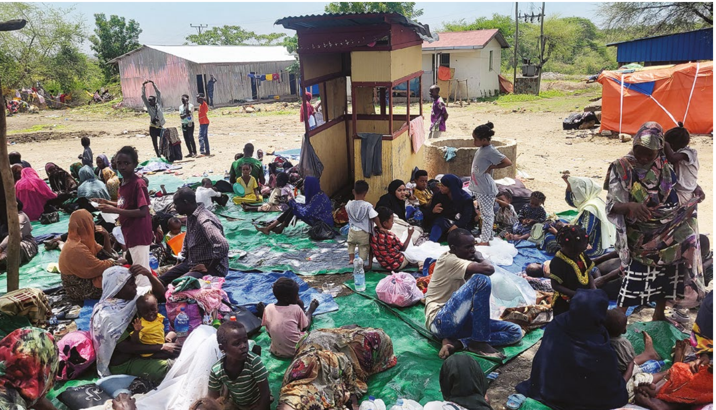
📷 New refugee arrivals. Metema, Ethiopia.

Against the backdrop of a displacement crisis of exceptional scale and scope, humanitarian resources to respond are being stretched to breaking point. The crisis in Sudan caught the international diplomatic community off guard, and humanitarian operations in neighbouring countries were already underfunded and working at maximum capacity when people began to flood across their borders.