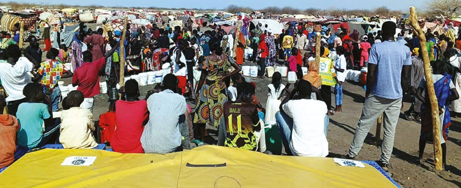
📷 Water reception area in a transit centre in Renk, South Sudan.

Children have also lost access to education. Ninety per cent of displaced households have children who were in school in Sudan, but there are few education services in their places of refuge. Further camps are being planned, but there is not enough funding to complete them. Other refugees are living in host communities, where there are also few if any education or other services. Adre, a border city 27 kilometres from Geneina, is the main crossing point from West Darfur into Chad and around 150,000 refugees are still living there.