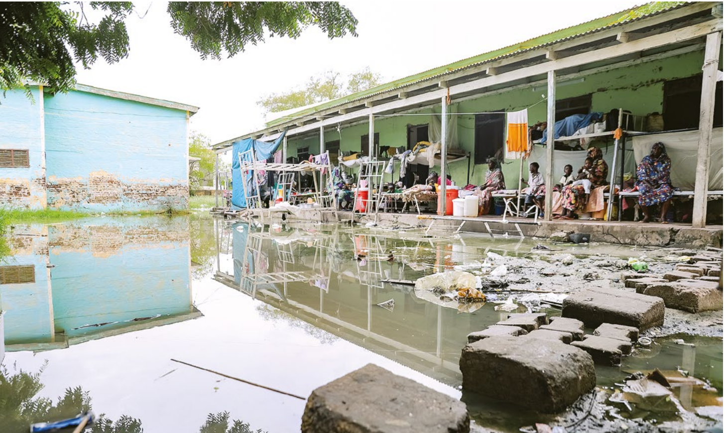
📷 IDPs in an abandoned school in Kosti, Sudan.

Sudan has long been said to be the heart of Africa, and the effects of its internal conflict are being felt throughout its seven neighbouring countries. The personal stories of people fleeing the violence are each unique, but this report attempts to capture the broad themes and trends that tie their experiences together.